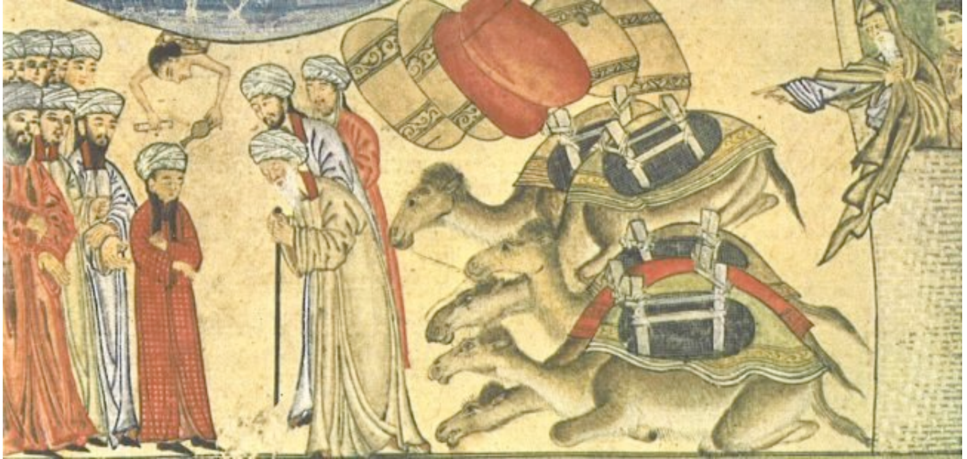
Bahira the Monk from the Monastery of St. Catherine greets a special caravan in search of the Seal of Prophets whom he believed was already born From Jami' al-tavarikh ("Compendium of Chronicles"). Tabriz, Persia, c. 1315. In the Library of the University of Edinburgh.

In 628 C.E. the Holy Prophet Muhammad (s) granted a Charter of Privileges to the monks of St. Catherine Monastery in Mt. Sinai. It consisted of several clauses covering all aspects of human rights including such topics as the protection of Christians, freedom of worship and movement, freedom to appoint their own judges and to own and maintain their property, exemption from military service, and the right to protection in war.